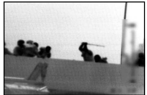
A frame from a video released by the IDF showing a pro-Palestinian activist hitting an IDF soldier with a rod-like weapon.

“This truth is gradually spreading around the world. It must be understood that this was not a unique incident. This is a continuous process that enemies of Israel have been orchestrating for years in order to deny Israel’s right to defend itself. I would like to emphasize: We will not allow the establishment of an Iranian port in Gaza. We will not allow the free flow of war materiel and contraband to Hamas ... On the other hand, we would like for goods that are neither war materiel nor contraband to enter Gaza.”