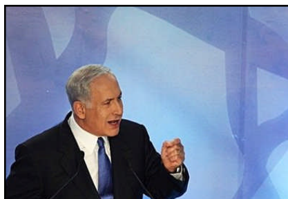
Benjamin Netanyahu delivers his peace policy speech at Bar-Ilan University, Ramat Gan, June 14, 2009.

Prime Minister Binyamin Netanyahu uttered the words “Palestinian state” in a mid-June speech that mixed tough Zionist statements with talk of peace and conciliation.