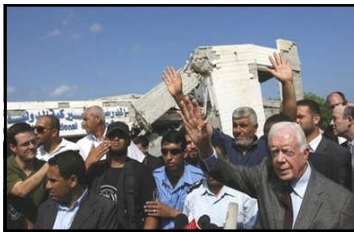
Former President Jimmy Carter in Gaza after urging Israel to lift its blockade and stop treating its residents like "savages."

Haniyeh told Carter that he supported any plan that aims at preserving Arab rights and leads to the establishment of a sovereign Arab state on all the territories that were occupied by Israel in 1967 "with Jerusalem as its capital." He urged Carter to pressure Israel to lift the security blockade which was imposed on Gaza's border crossings to prevent weapons smuggling.